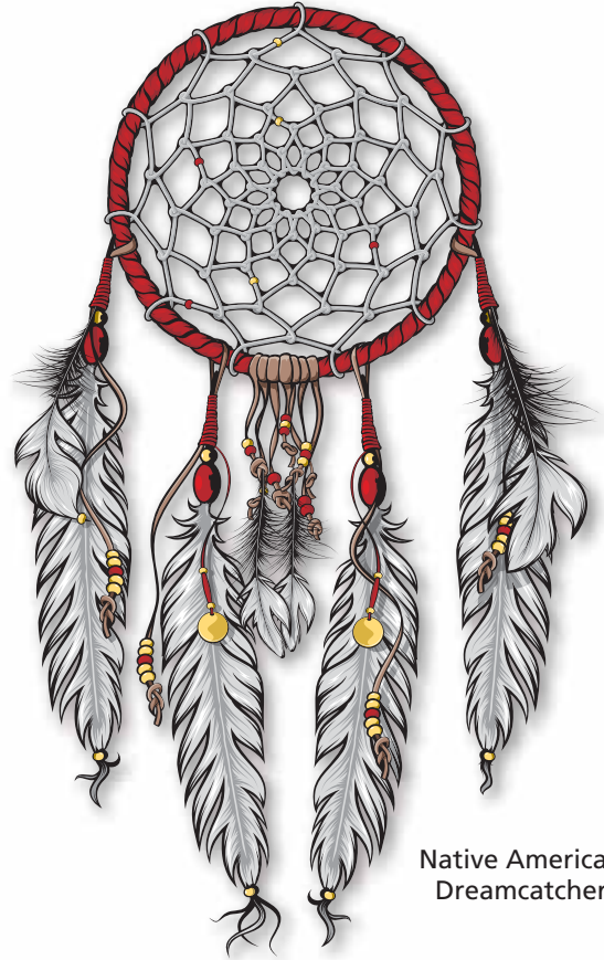
Native American Dreamcatcher