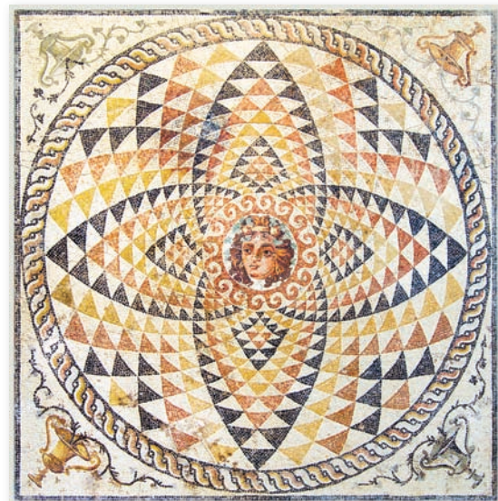
Ancient Roman Mosaic